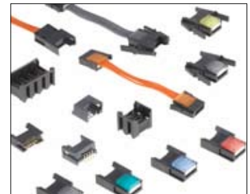
3M™ Mini-Clamp Socket Connectors