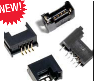
3M™ Mini-Clamp Socket, 2 mm, Surfacemount, Right Angle