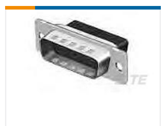
TE Model / Part #205210-3 PLUG ASSY SIZE 4