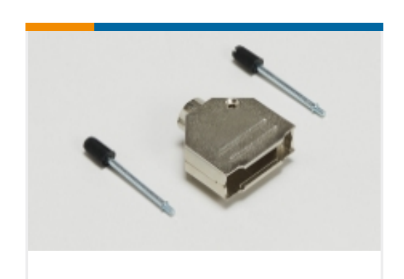
D-Sub Backshells & Clamps(137)