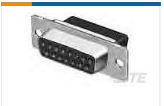
TE Model / Part #205205-2 CRIMP SNAP RCPT ASSY,SIZE 2