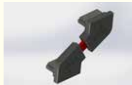
SATA 7P TO 7P ADAPTER