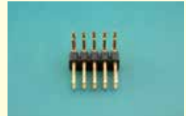
STRIP HEADER RIGHT ANGLE