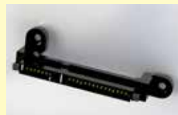
22SAHS EXTENDED HT