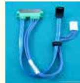
22SAHS TO 7P SATA & 4P HOUSING