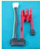
UNITIZED ASSY WITH EARS, ROHS COMPLIANT