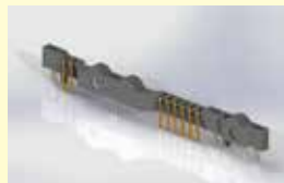
POGO PIN CONNECTOR ASSEMBLY STATIONARY USB 3 THROUGH HOLE