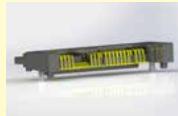
29P SMT WITH PAD SAS CONNECTOR