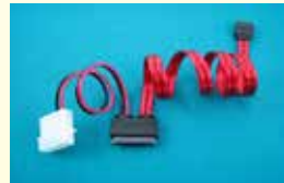
SATA CABLE ROHS COMPLIANT