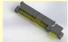
CONNECTOR WITH 4P POWER