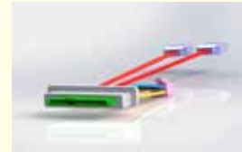
SAS 29P TO 7P(2) & 6P HSG CABLE ASSEMBLY