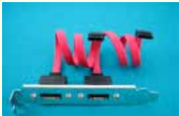
300MM ESATA SATA CABLE