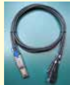
MINI SAS TO ESATA