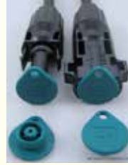
LOCKING DUST COVER