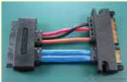
MICRO SATA 16P TO 22P