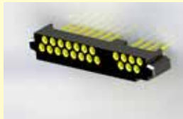
CONNECTOR ASSEMBLY, PCB MTG 22MS