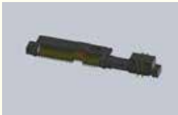
29SASR ADD 8PIN POGO HDD SOCKET CONNECTOR