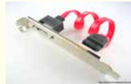
SATA, ROHS COMPLIANT