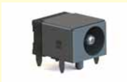
DC POWER JACK