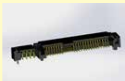
29SASR+04POS, SAS SMT