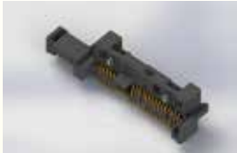
33SASR SMT TYPE SOCKET CONNECTOR