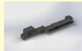
29SASR ADD 8PIN POGO 3.5 HDD SOCKET CONNECTOR