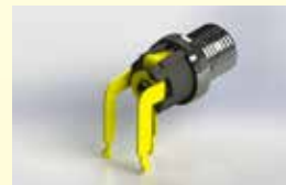
RIGHT ANGLE POWER JACK