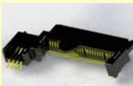
29SASR+04POS FOR BLOCK ASSEMBLY, SMT TL