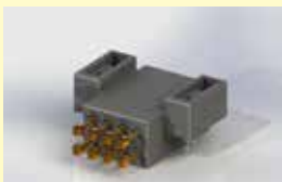
8P POWER CONNECTOR FOR 37SASR SOCKET