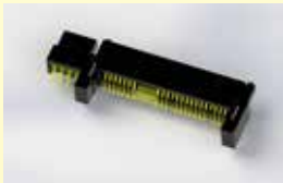
33POS SMT SAS COMBO CONNECTOR