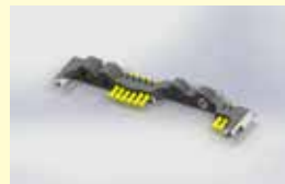
POGO PIN CONNECTOR ASSEMBLY SACRIFICIAL USB 3