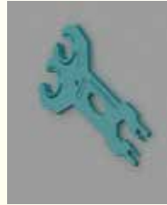
LATCH AND INSTALLATION TOOL