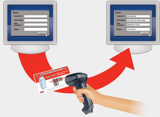
Easily parses GS1 application identifiers